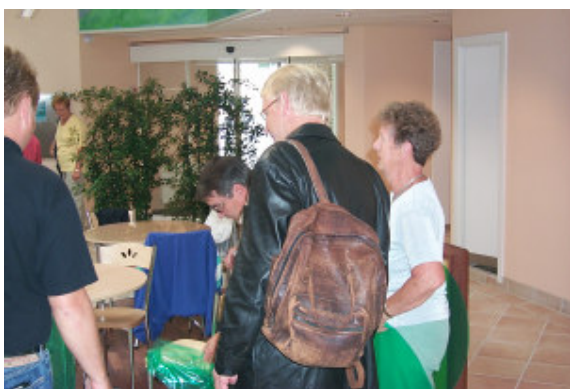
Fig. 15 - The Green Launderette has been working for 5 years.

The inhabitants around the building where the launderette is situated have arranged picnics in the launderette and they held a „water concert“ broadcasted in the Danish Radio.