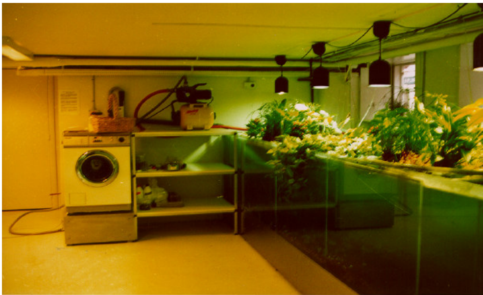
Fig. 3 - The green recirculating laundry at Kompagnistræde.

This aeration system is used in all the shop’s aquariums and is probably the most commonly used bed filter for aquarium owners in Denmark. The same system is used in the Green Recirculating Laundry and the Drainless Kitchen .