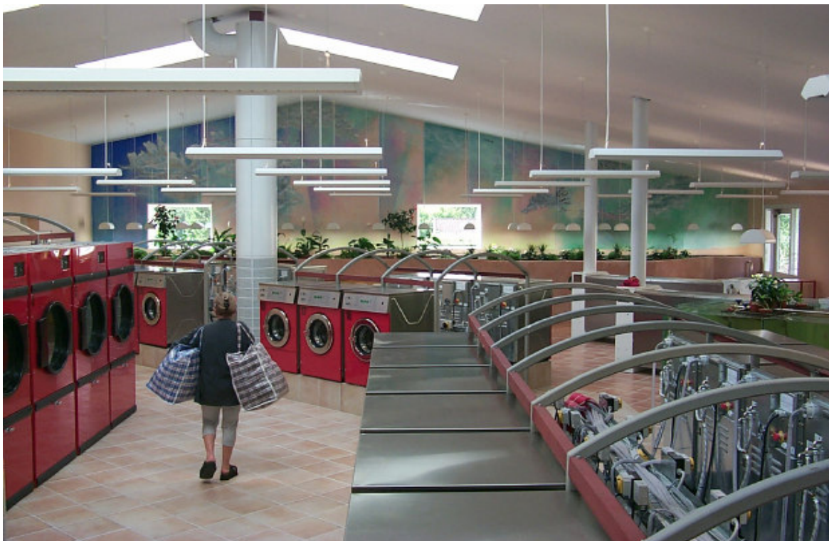
Fig. 8 - The opening day - 25 August 2000.

The Torben Wormslev firm, in the person of Søren Knudsen, has been in charge of all financial calculations for the establishment of the renovated launderette. The prices are shown in the table on page 9.