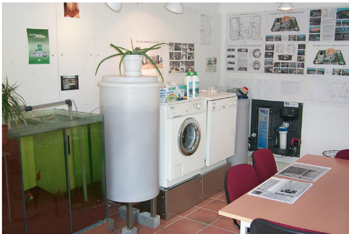
Fig. 1- Demo-model for the Drainless Kitchen set up at EBO Cosult Ltd. 29 March 1999. The water is purified to drinking water quality before being recycled. Not connected to water supply or sewer systems.