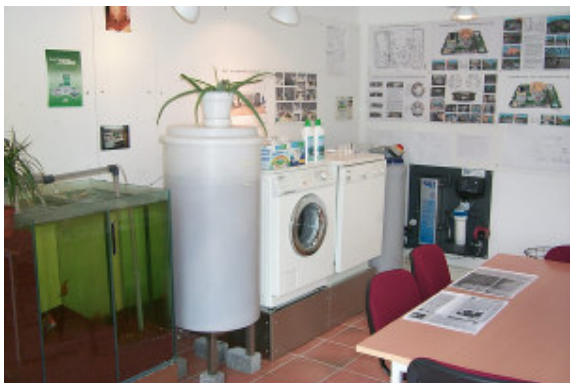
Fig. 5 - Demo-model for the Drainless Kitchen set up at EBO Consult on 29 March 1999. Dishes and clothes washed in the same water for almost 2 years. The water was purified to drinking water quality before being recycled. Not connected to water supply or sewer.

The jet sub pump supplied the washing machine with the required water at a pressure of 3 bars.