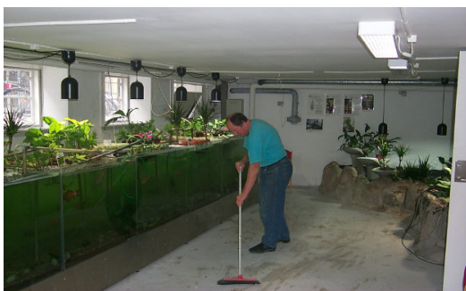
Fig. 4 - Demo-model for the Green Circulating Laundry that was set up at EBO Consult in Kompagnistræde in July 1997. The laundry washed in the same water for 4 years.

The water left the system as overflow and was piped into a collection tank. The water was exposed to UV illumination in the collection tank and was ready for reuse when the washing machine was started.