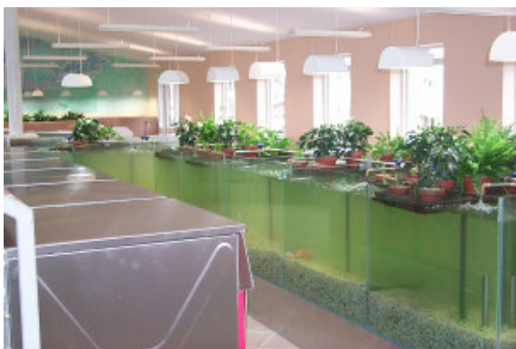
Fig. 11 - The sectioned glass aquarium has a total length of approximately 8 metres. Its principle design is the same as the system in Kompagnistræde. A mineral/biological filter is established at the bottom. The beds of the sections are interconnected from one section to the next.

The overflow water from the last section in the treatment aquarium is piped under the floor into the last large area with biological filter and the planted marsh area.