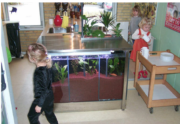
Fig. 6 - „Drainless Kitchen Unit“ at Mosebo Kindergarten.

In the winter 2000 EBO Consult established a biological treatment unit for one washing machine and one dishwasher in a kindergarten at Solrød Strand, south of Copenhagen. The unit consist of a room divided aquarium at a size of 60 x 120 x 85 which means it can fit under a kitchen table (see picture underneath)