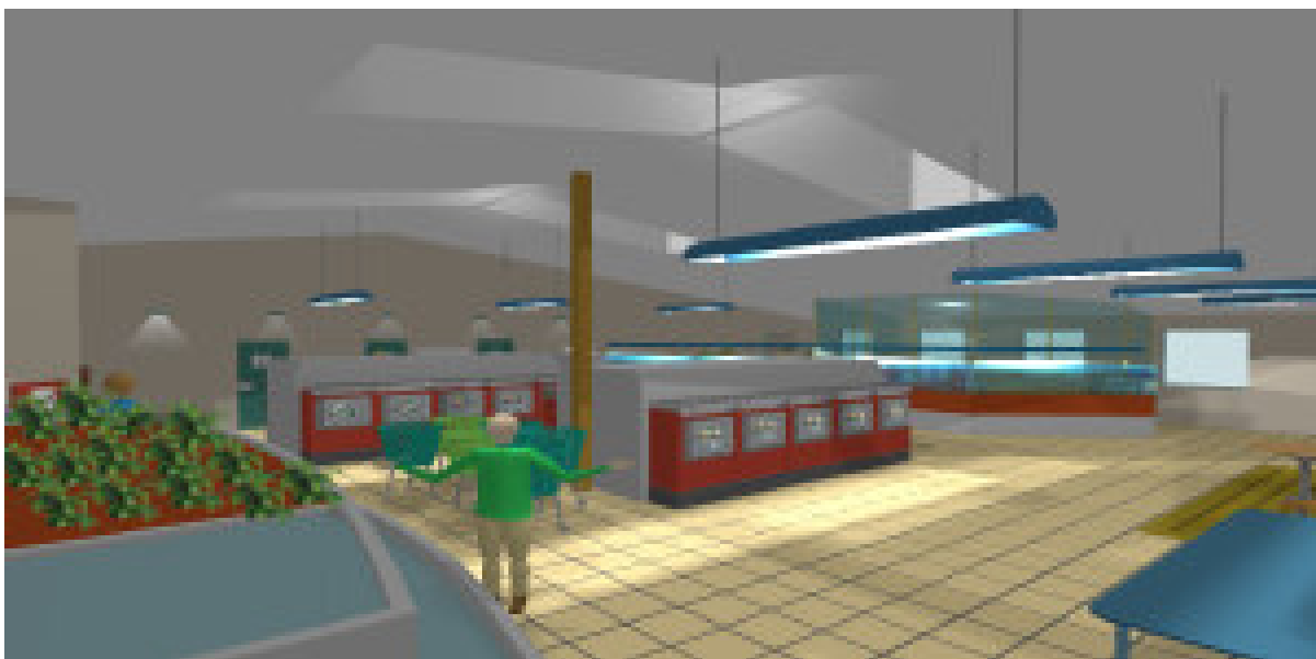
Fig. 7 - Proposed layout of the laundry, drawn by Anders Henriksen for EBO Consult.

As mentioned on page 5 The 3B Joint Adm. requested EBO Consult to calculate the specifications for a biological treatment system for the large communal launderette at Folehaven. The first proposal was ready in December 1998 and formed the basis for continued project work together with the firm of architects Jørgen Hammelboe ApS and the firm of consulting engineers Torben Wormslev.