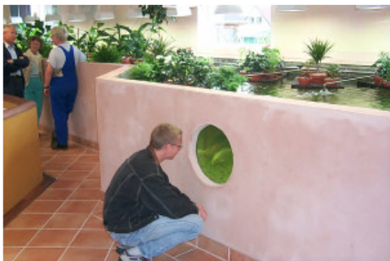
Fig. 12 - The final mineral / biological filter, with the marsh area in the back.

All plants in the Launderette are illuminated by growing lamps.