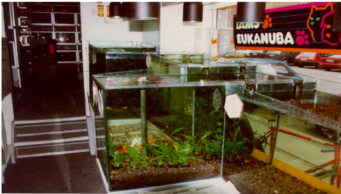
Fig. 2 - Aquarium system at Tandkarpen - Amagerbrogade 9B – DK 2300 Copenhagen S.